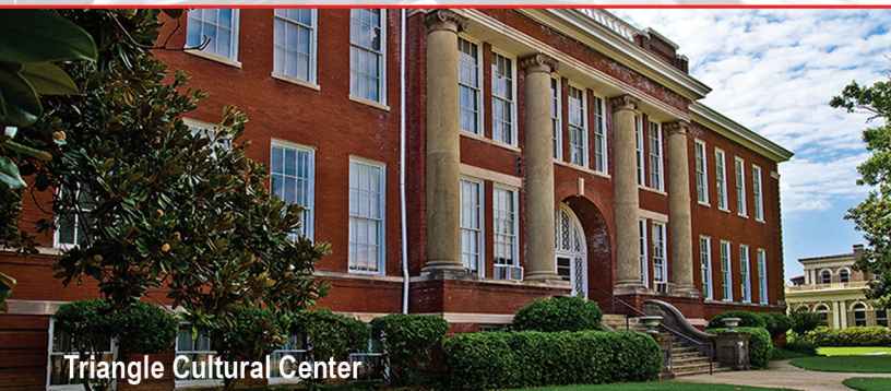
Triangle Cultural Center

Yazoo's history began with Native Americans, both regional and small local tribes. The small tribe of Yazoos, who gave the region its name, was 'along with the much larger Choctaw Nation which dominated the area' the first of these people to be encountered by French explorers led by Cavalier De La Salle in 1682. It was the French who, on the maps, first name the river, which flows through the middle of the county "The River of The Yazous." The county and city were later namesakes of the river. No one is quite sure what the word Yazoo meant in their tongue, for the tribe quickly died out after the Europeans came.